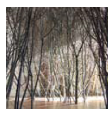
Olafur Eliasson The Forked Forest Path. 1998