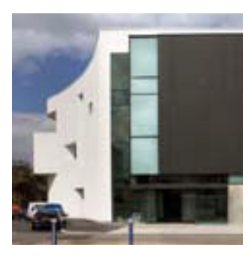
Front elevation