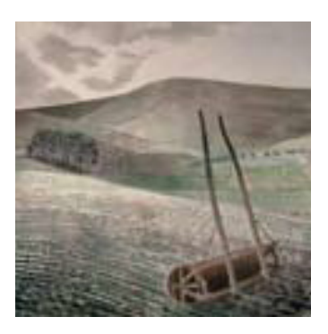
Eric Ravilious Downs in Winter, 1934 Towner Collection

Towner will present five major exhibitions per year. The programme will include exhibitions by national and international contemporary artists alongside emerging British artists and an annual historical art exhibition.